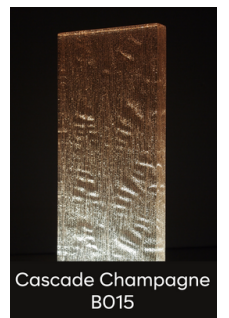
Cascade Champagne B015