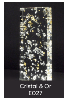
Cristal & Or E027